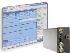
SONET/SDH test modules FTB-8115 – FTB-8120 FTB-8130 – FTB-8140