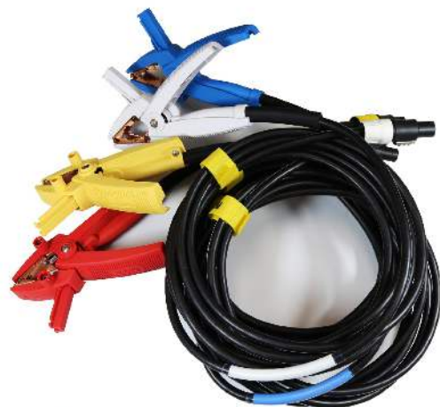
32 A X leads TAU3 PRO, TAU3 EXP