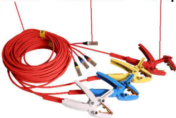
16 A H leads TAU3 BASIC, TAU3 ADV, TAU3 PRO, TAU3 EXP