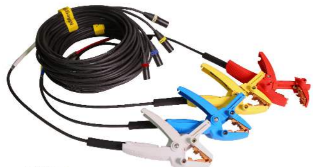
16 A X leads TAU3 BASIC, TAU3 ADV