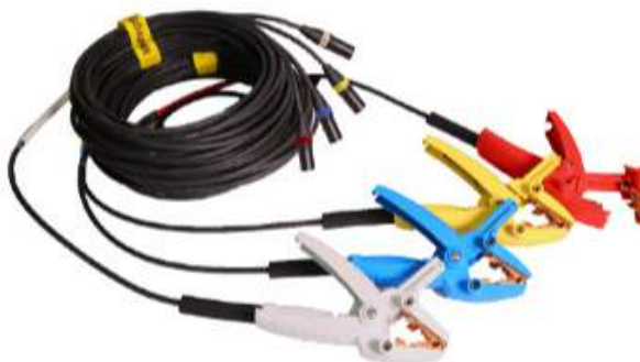
16 A X leads - MTOU3 BASIC, MTOU3 ADV