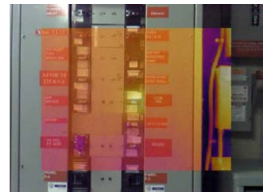
50 % blending, picture-in-picture mode