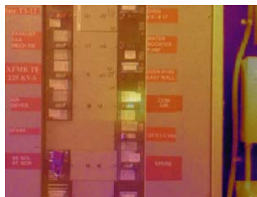
50 % blending