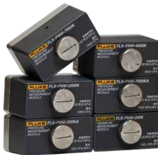
Figure 1. Rechargeable lithium battery with capacity indication.

HART communication enables mA output trim, trimmed to applied values, and pressure zero trimming of HART pressure transmitters. You can easily change a transmitter tag, measurement units and ranges. Other supported HART commands include setting fixed mA outputs for troubleshooting, reading device configuration parameters and reading device diagnostics.