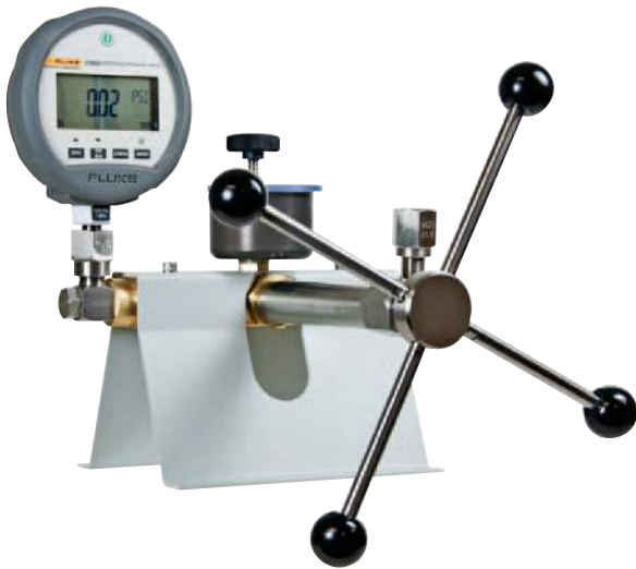
Combine the 2700G gauge with the P5510, P5513, P5514 (shown here) or P5515 Comparison Test Pumps for a complete bench top pressure calibration solution.

The 2700G Reference Pressure Gauges provide best-in-class measurement performance in a rugged, easy-to-use, economical package. Improved measurement accuracy allows it to be used for a wide variety of applications. It is ideal for calibrating pressure measurement devices such as pressure gauges, transmitters, transducers, and switches. In addition, it can be used as a check standard or to provide process measurements with data logging.