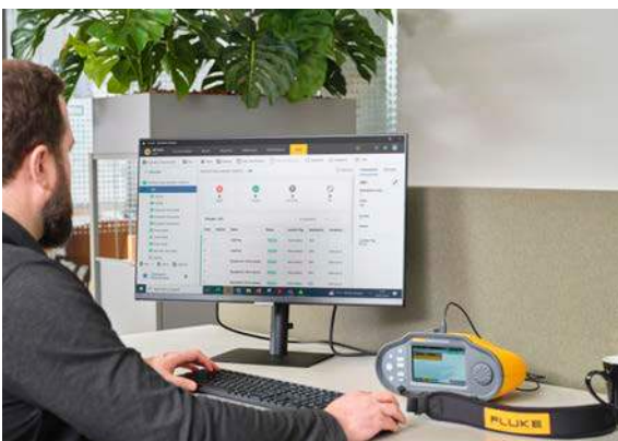
TruTest Software simplifies electrical system data management and reporting

The Fluke 1674 FC includes a patented Insulation PreTest, so you can better protect the installation and avoid costly mistakes. If the tester detects that appliances are connected to the system during the test, it will stop the insulation test and provide a visual and audible warning. This helps eliminate accidental damage to peripheral equipment and saves you both time and money.