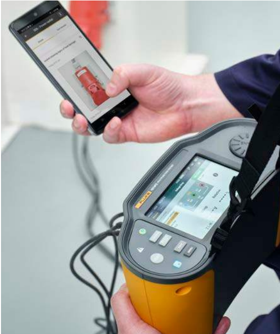
Assign photos directly to specific test points for more detailed documentation