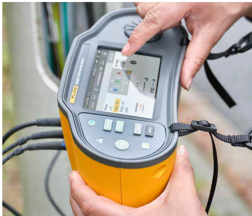
Full-color touch screen and tactile rotary knob for fast navigation

Simplify report generation with automatic report population, Fluke Connect integration, and one-touch reporting with Fluke TruTest™ software.