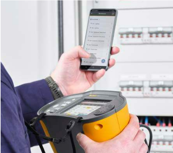
Reduce manual data entry and recordkeeping