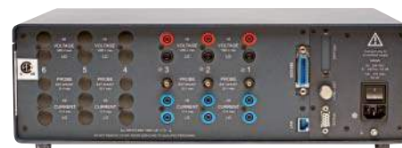
Fluke Norma 5000 (rear panel)