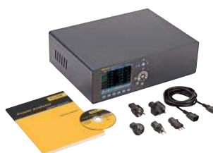
Fluke Norma 5000 Basic Configuration