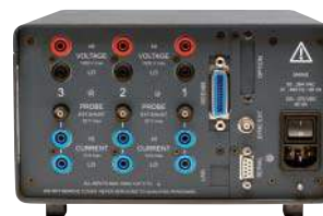
Fluke Norma 4000 (rear panel)

Each modular plug-in power phase consists of a voltage and a current measurement channel. Each measuring channel is available for each basic unit. However, only one kind of channel can be used per unit (see standard configurations).