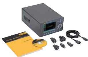
Fluke Norma 4000 Basic Configuration