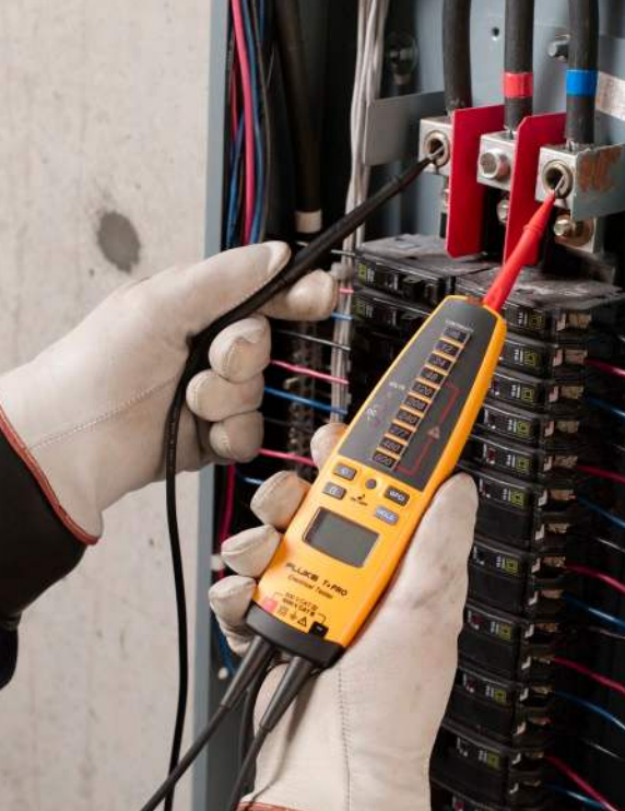
Electronic testers like this Fluke T+ vibrate, beep, and glow to indicate voltage, giving you the feel of an old-fashioned solenoid in a safer electronic model.

ability to measure higher voltages limits the capability to detect voltages below about 100 V due to the poor dynamic range of the magnetics, an unfortunate weakness of solenoid testers. Try using one on 24 V or 48 V control circuits, and you may as well be using a stick of wood.