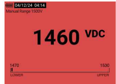
Limit gauge - outside of range