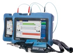
Fiber certifier OLTS MaxTester 940